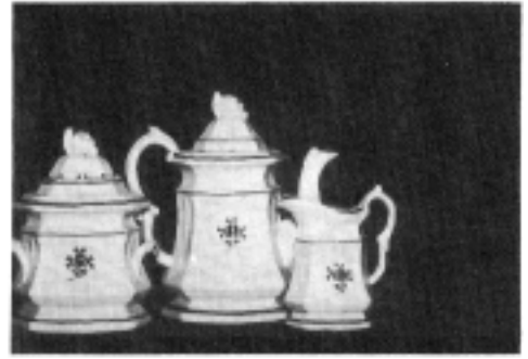
Left: Cinquefoil Paneled Grape coffeepot; center: New York Shape Coral sugar bowl; right: Grape Octagon Pomegranate table set

And some Teaberry-a variant nearly everybody likes.