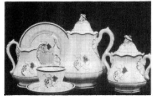
Left: Gothic Shape Teaberry pitcher and bowl; center: Chinese Shape Teaberry; right: Elsmore & Forster Portland Shape Reverse Teaberry table set; Left, center: Berry Cluster Teaberry relish (unmarked); below, left: Augusta Shape Teaberry cake plate