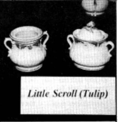
Little Scroll (Tulip)

| Characteristics: Artichoke finial, stepped cone lid, flared rim, distinctive split where coffeepot handle meets neck, embossed with foliage design from handle terminals covering entire body