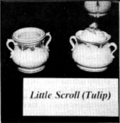
Little Scroll (Tulip)

| Characteristics: Artichoke finial, stepped cone lid, flared rim, distinctive split where coffeepot handle meets neck, embossed with foliage design from handle terminals covering entire body